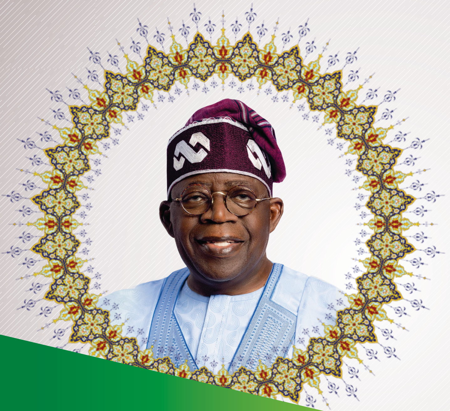
His Excellency, Senator Bola Ahmed Tinubu , GCFR President and Commander-in-Chief of the Armed Forces of the Federal Republic of Nigeria