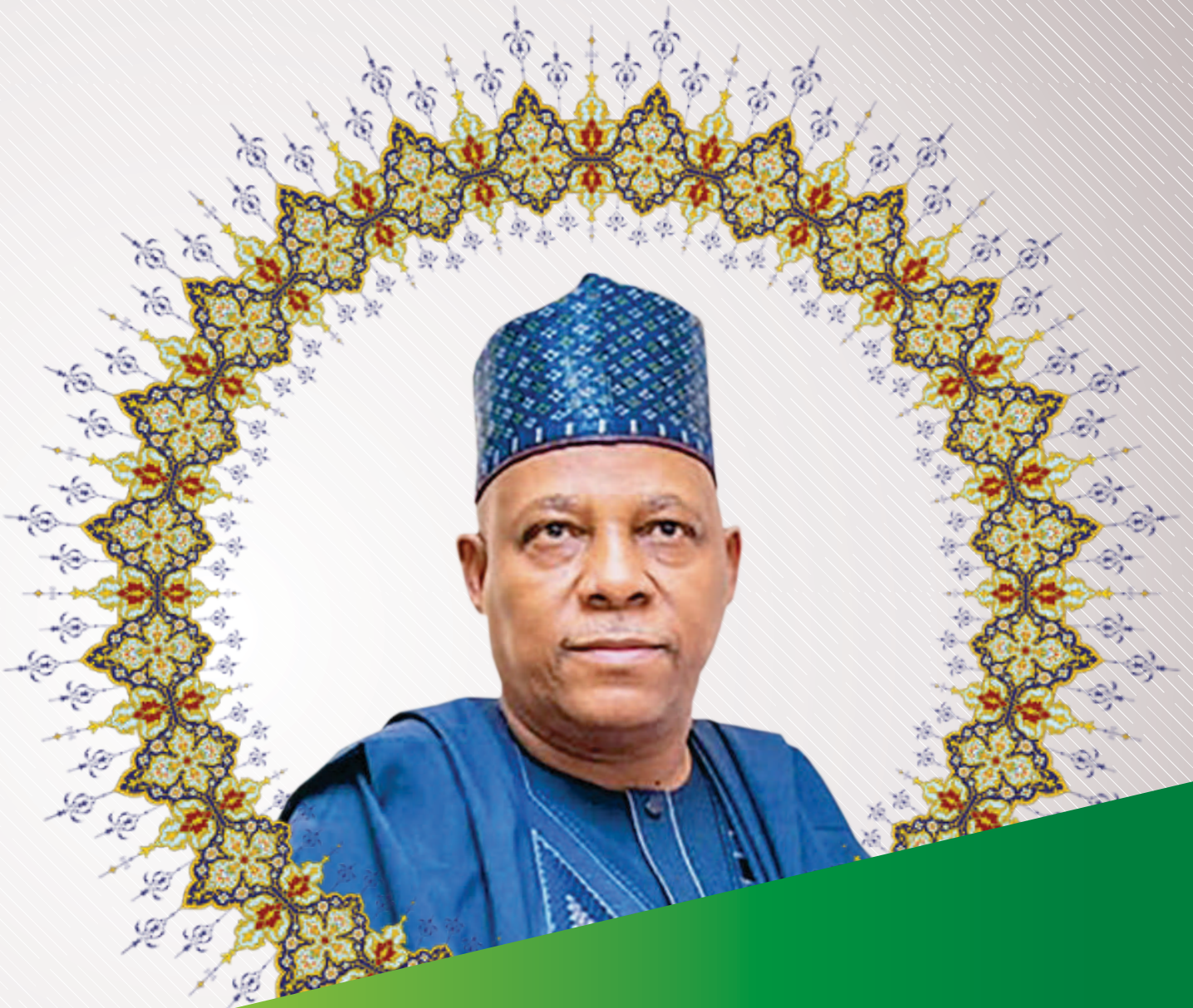
His Excellency, Senator Kashim Shettima, GCON Vice President, Federal Republic of Nigeria